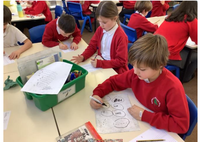
Learning times tables in Warrenwood.