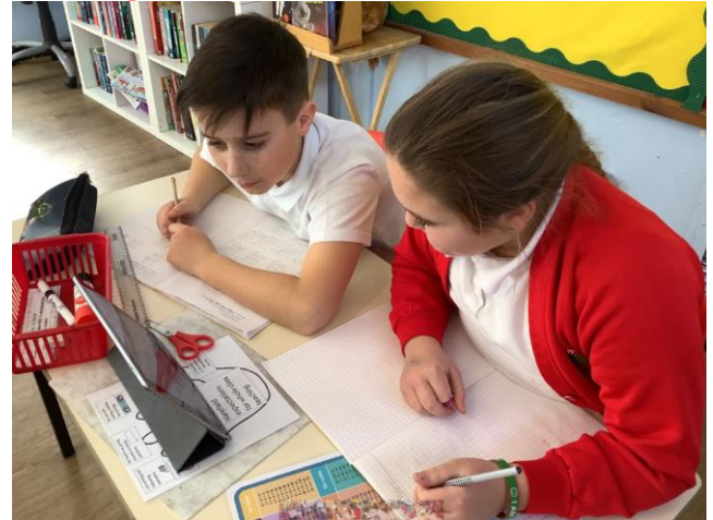
Maths challenges in Harefield.