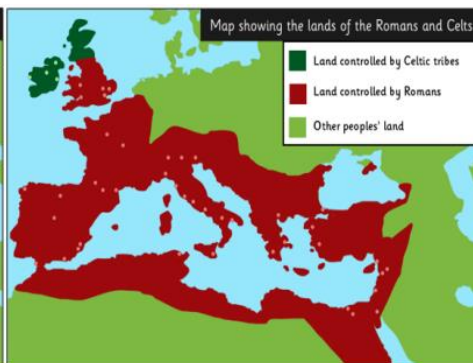
117AD. The Height of the Roman Empire.