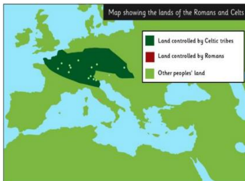
8000BC. Most of the land owned by the Celts and other groups.